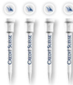
Tee shafts & heads