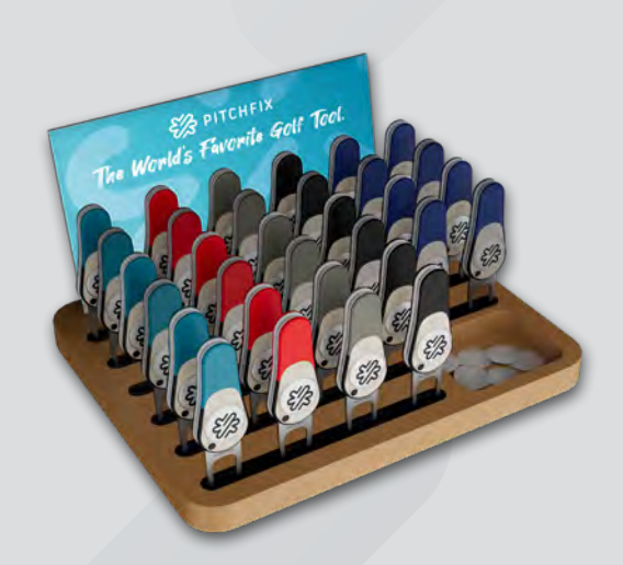
PAR 2.0 DISPLAY™ FITS ALL TOOLS.

FITS ALL TOOLS. EXTRA TOOL, HAT CLIP OR ALIGNMENT MARKER INSERTS ARE AVAILABLE.