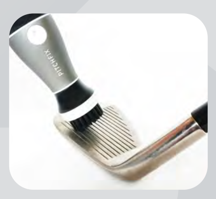
A hand-held club brush, with two brushes to clean club-head grooves.