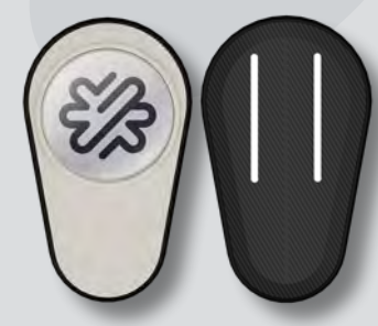
THE CHIP™ CARBON