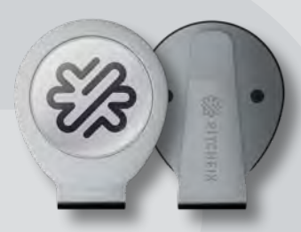
THE HAT CLIP™ WHITE