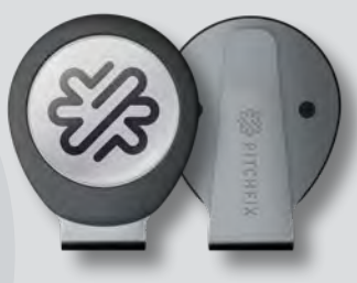
THE HAT CLIP™ GUN