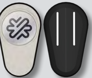
THE CHIP™ BLACK

Available as a single tool, as a gift collection when paired with relevant tools and hat clips or as a retail collection. Ideal for combining with other golf accessories in event goody bags too!