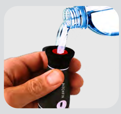
Unscrew the brush-head to fill Aquabrush with water before use.