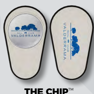
THE CHIP™ CUSTOM DESIGN

You can create your own unique alignment chip by customizing the back-side with your own artwork or by adding your logo. MOQ 250 pcs.