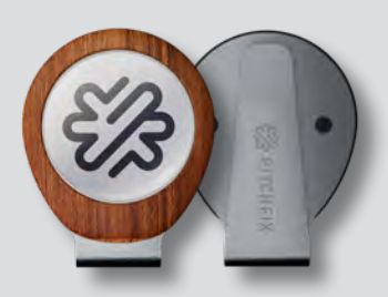
THE HAT CLIP™ WOOD