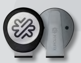
THE HAT CLIP™ BLACK

Clip on to your cap or hat to provide easy and convenient access to a ball marker on the course. Our clip simply attaches onto your headwear and features a customizable magnetic ball marker to mark your ball on the green. Available as a single item, as a gift collection when paired with relevant tools. Ideal for combining with other golf accessories in event goody bags too!