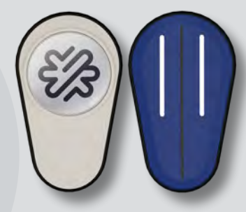
THE CHIP™ BLUE

You can create your own unique alignment chip by customizing the back-side with your own artwork or by adding your logo. MOQ 250 pcs.