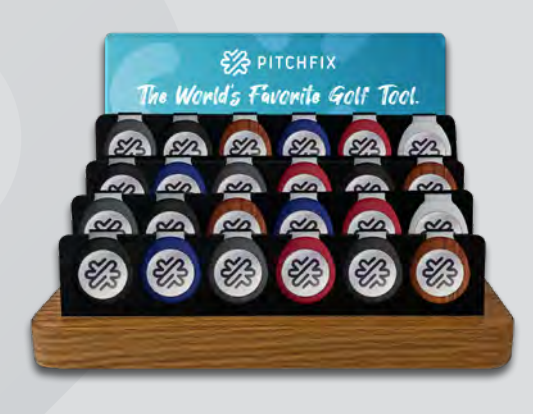
HAT CLIP DISPLAY™