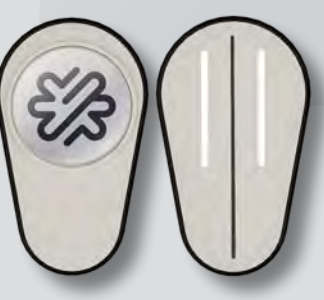
THE CHIP™ WHITE