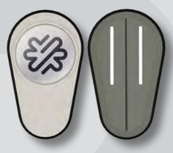
THE CHIP™ GUN