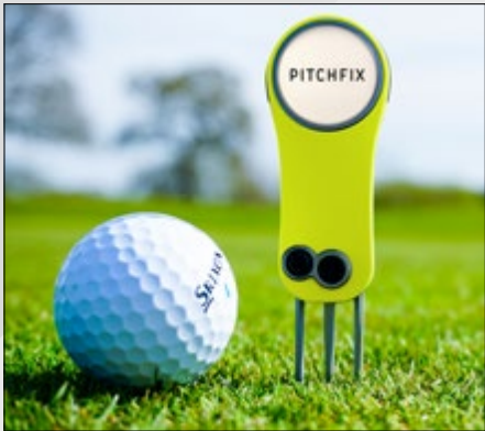
Choose a color to match your logo and create a stunning range.