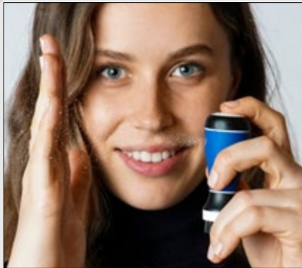
Press the head to spray water to dampen the club before brushing clean.