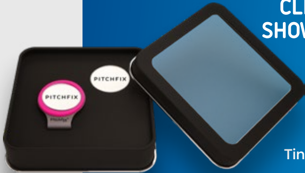
Tin window for Hatclip.