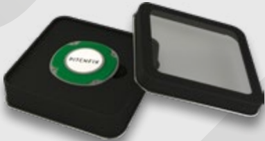
Tin window for MultiMarker Chip.