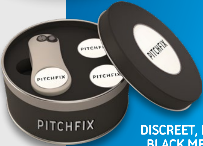
Round tin with 2 extra Ball Markers.