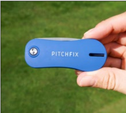
Compact, attractive design.