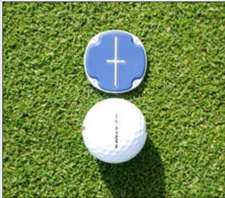
Line up putts.