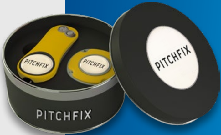
Round tin with MultiMarker Chip.