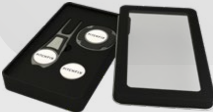
Tin window for Tour Edition and MultiMarker Chip.