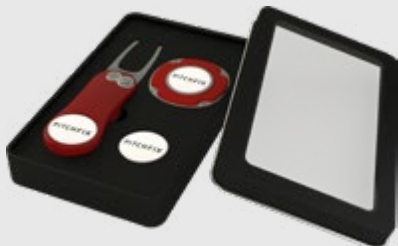
Tin window for Original 2.0 and MultiMarker Chip.