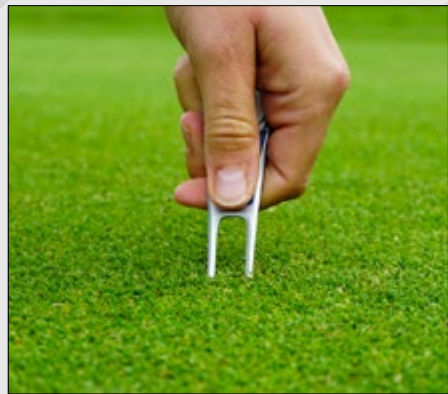
Simple to use to repair ball marks effectively.