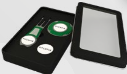
Tin window for Tour Edition 2.5 and MultiMarker Chip.