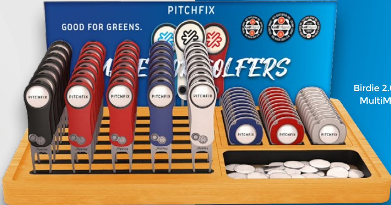
Birdie 2.0 display with added MultiMarker Chip module.