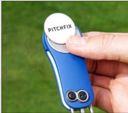
Every tool features a removable, magnetic ballmarker too.