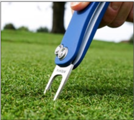
Familiar orthodox repair technique.