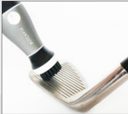
A hand-held club brush, with two brushes to clean club-head grooves.