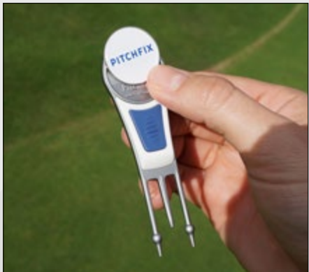
Removable branded ballmarker.