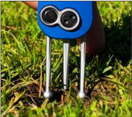
Insert into the centre of the compacted turf, to repair without damaging roots.