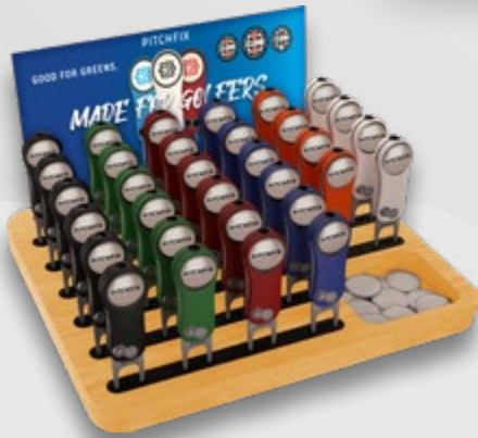
Par 2.0 (Fits all Tools).