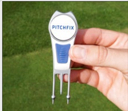
Strong, single moulded design featuring Repairtec, one-push engineering.