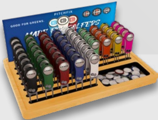
Birdie 2.0 display with added 16 tools module