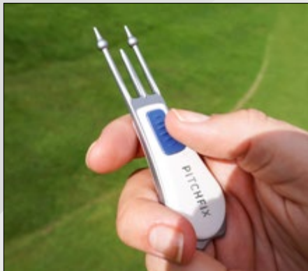
Designed for comfort with color-coded thumb grip.