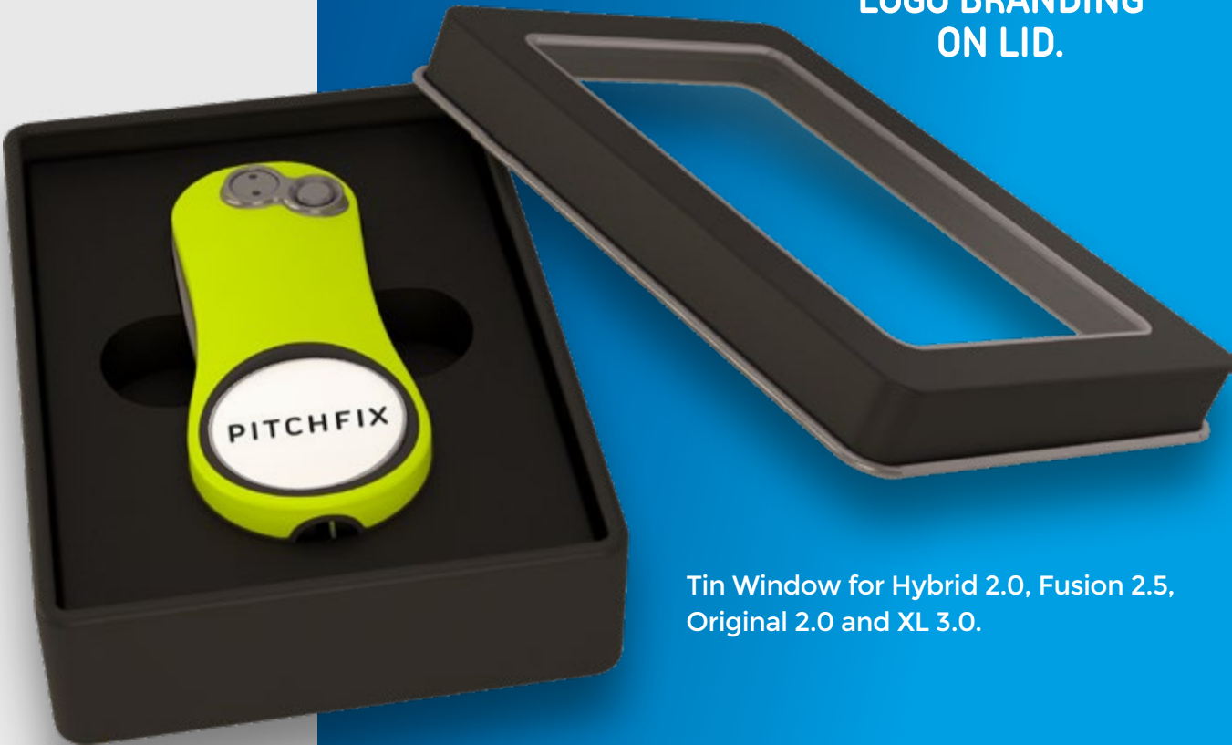
Tin Window for Hybrid 2.0, Fusion 2.5, Original 2.0 and XL 3.0.