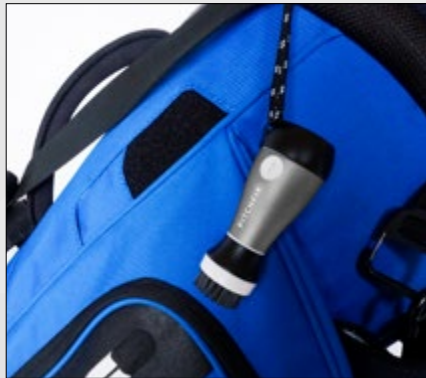
Designed to hang on your bag and allow easy access during your round.