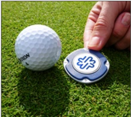
Mark ball positions.