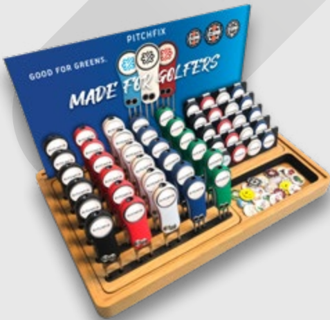
Birdie 2.0 (Fits all Tools).