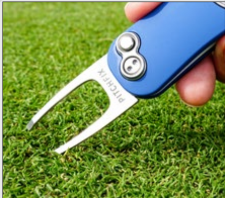
Extra strong, featuring a reinforced aluminium body and steel blade.