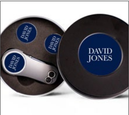
Personalise your tin or ballmarker with the recipients name.