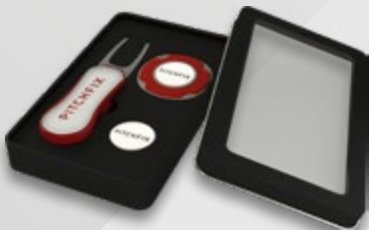
Tin window for XL 3.0 and MultiMarker Chip.