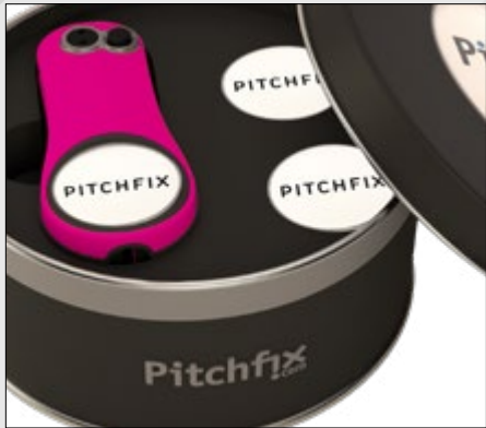
Choose your own tools and configure with unique colors and logos.