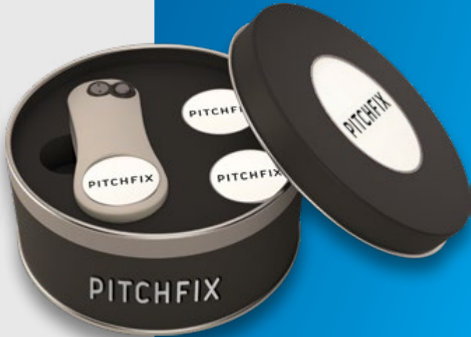
Round tin with 2 extra Ball Markers.