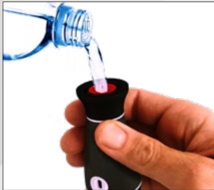
Unscrew the brush-head to fill Aquabrush with water before use.