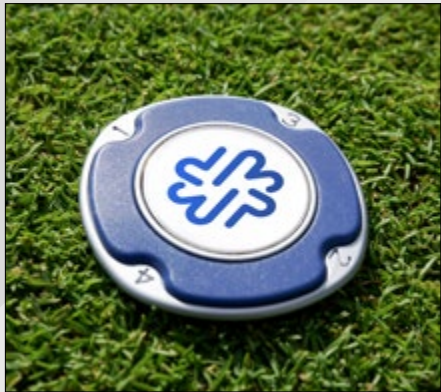
Decide order or play.