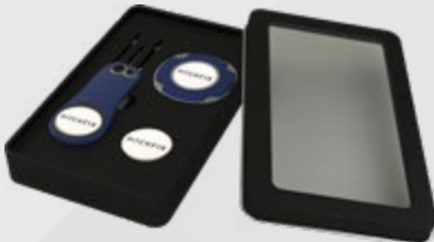
Tin window for Fusion 2.5 and MultiMarker Chip.