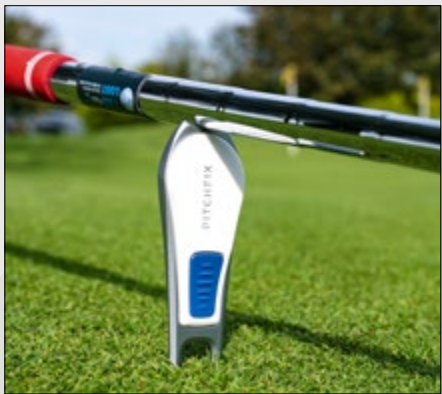
Use as a convenient club rest to keep grips dry when putting.