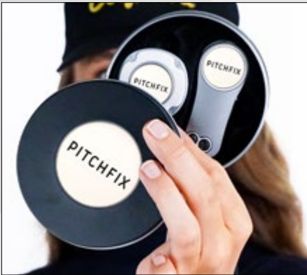
Create a memorable, high quality golf gift set.