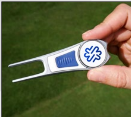
Iconic design with great branding on a removable ballmarker.