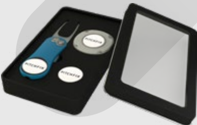
Tin window for Hybrid 2.0 and MultiMarker Chip.