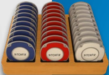
MultiMarker Chip Display (can replace hatclip module in Birdie 2.0 display).